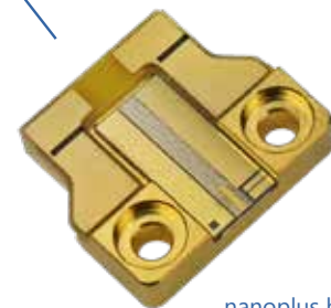
nanoplus high-power Fabry-Pérot laser on submount with AlN carrier

If you require custom specifications , please contact us. Nearly 80 % of our devices are more or less customer-specific. As nanoplus is a fully vertically integrated company , we control the entire process chain from design to packaging. Both nanoplus production facilities are based in Germany . To guarantee consistent product quality we apply a strict and ISO certified quality management system at all levels.